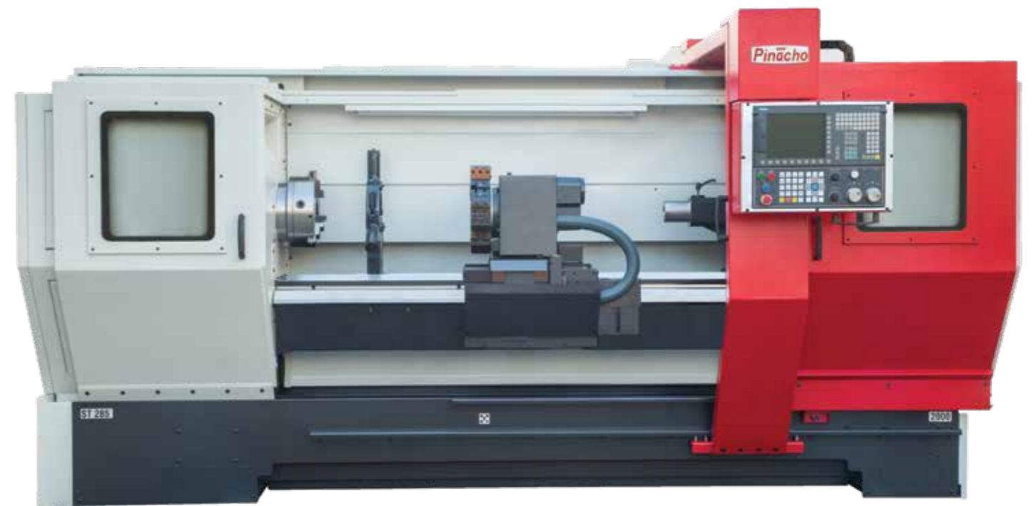
ST 285 x 2000