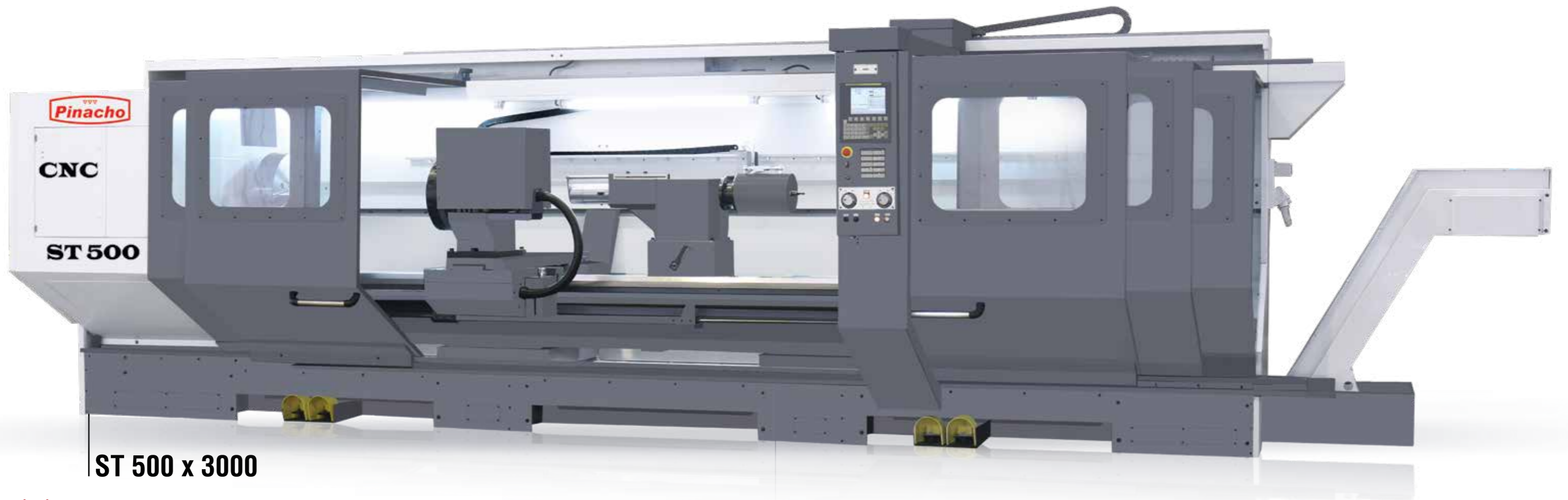
ST 500 x 3000