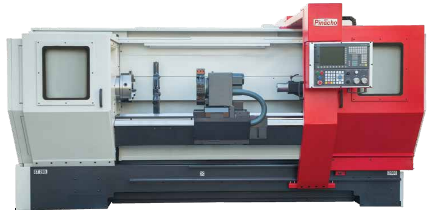
ST 285 x 2000